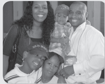
Scenes from the 12th International Conference in Detroit, 2010.