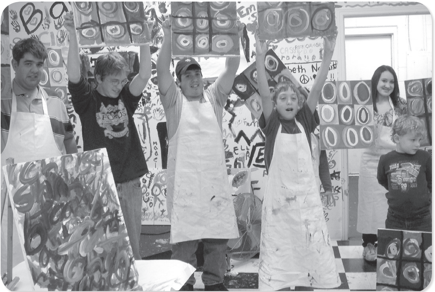
The jubilant artists, holding their day's work aloft.

As every parent and teacher knows, opportunities that enable personal success are important for promoting a child's self-esteem and confidence. Combine that with the joy of painting and it is not surprising that the Xpressions in Art program sparked interest in multiple families from the greater Atlanta area. Sips n Strokes operates in only three southern states, but similar programs that afford families of all types—including those with special needs—the opportunity to create paintings, ceramics and other works of art are gaining in popularity around the country. Such activities offer parents a productive response to the perennial question of children: “What are we doing tonight?”